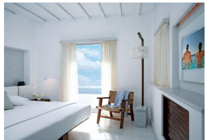
Product category: Hospitality | Guest room | 46.0"