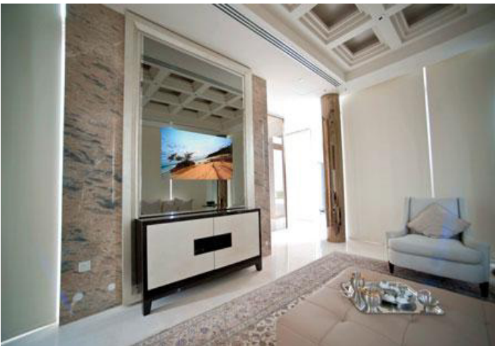
Product category: Hospitality | Guest room | 46.0"