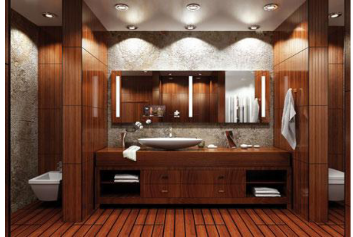
Product category: Hospitality | Bathroom | 18.5"