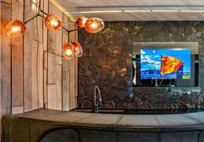
Product category: Hospitality | Restaurant, Bar | 65.0"